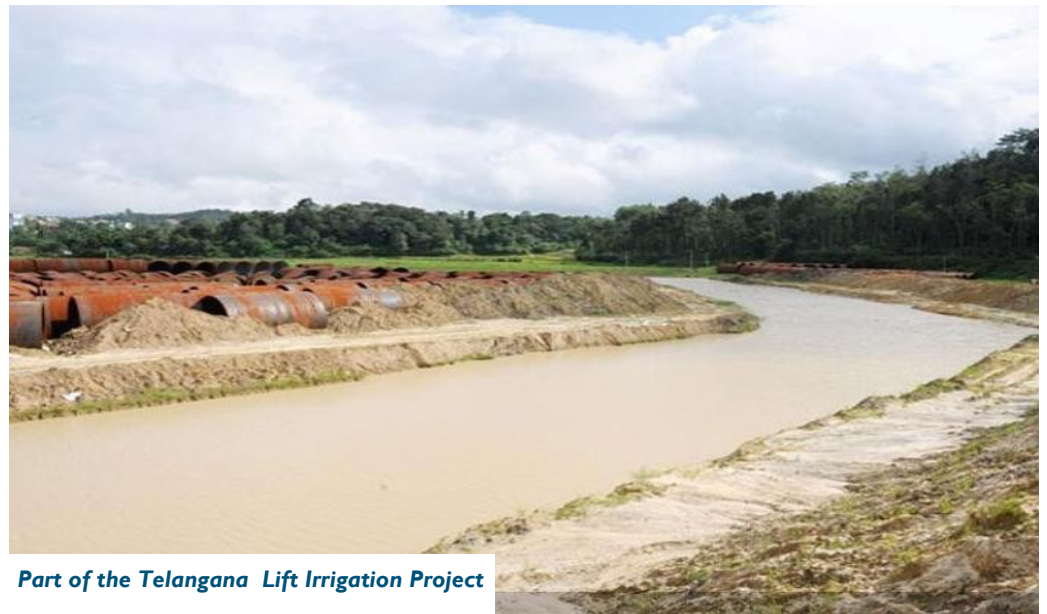
Part of the Telangana Lift Irrigation Project